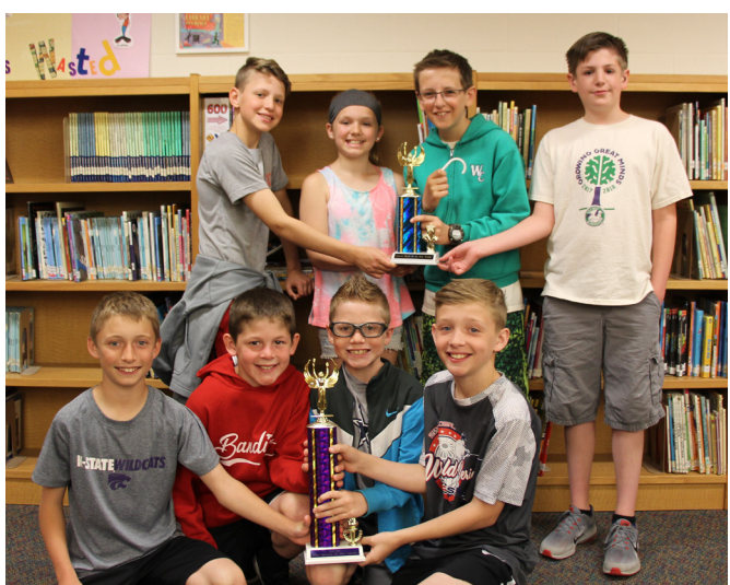
Prepared by USD 230 to educate patrons about the September 6, 2018 mail-in bond election.