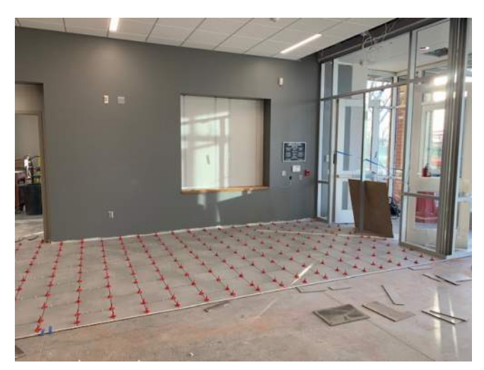
Ceramic Tile In Progress