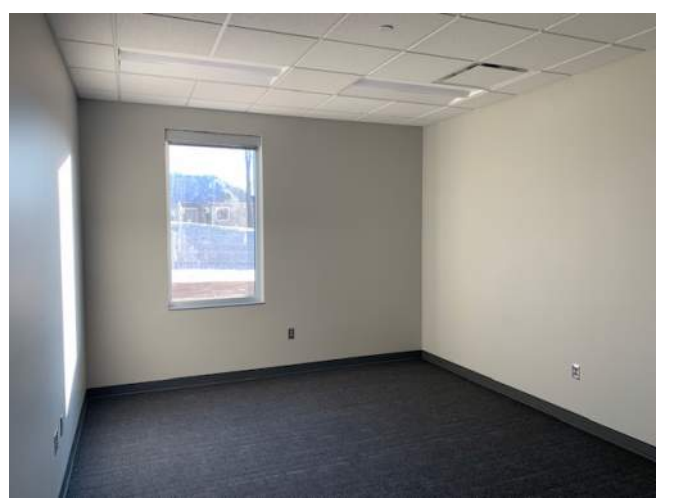
1<sup>st</sup> Floor Carpet