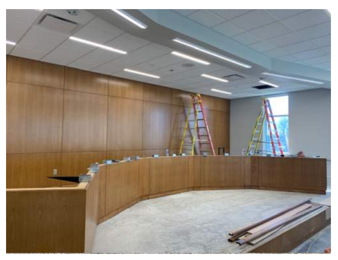
Board Room In Progress