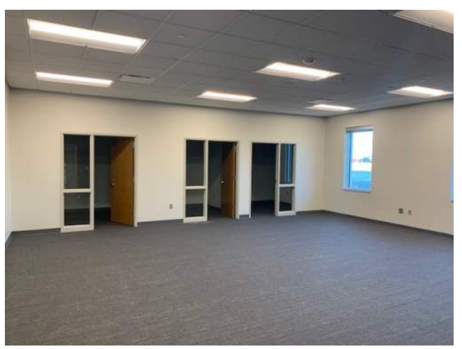
1<sup>st</sup> Floor Carpet