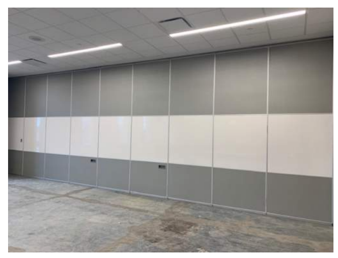
Board Room Partition