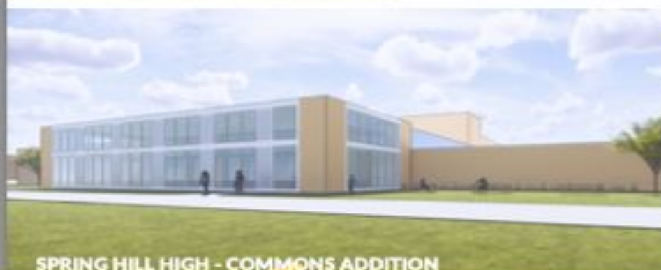
SPRING HILL HIGH - COMMONS ADDITION