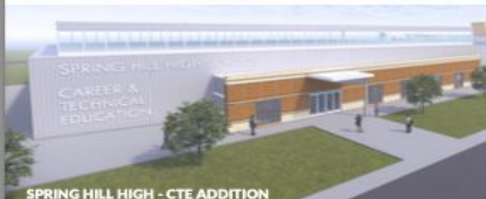
SPRING HILL HIGH - CTE ADDITION