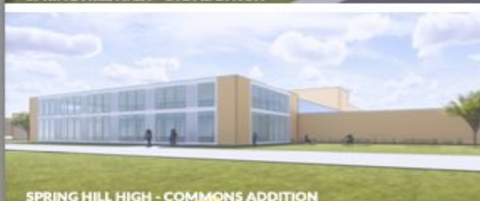
SPRING HILL HIGH - COMMONS ADDITION