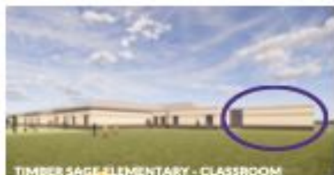
TIMBER SAGE ELEMENTARY - CLASSROOM