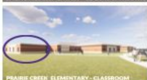
PRAIRIE CREEK ELEMENTARY - CLASSROOM