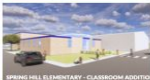
SPRING HILL ELEMENTARY - CLASSROOM ADDITION